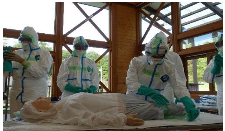
Emergency medicine training