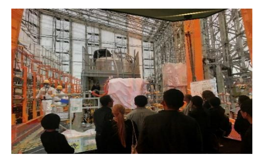
Visit to the Decommissioning Museum