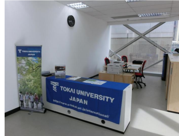
ASEAN Office in Thailand