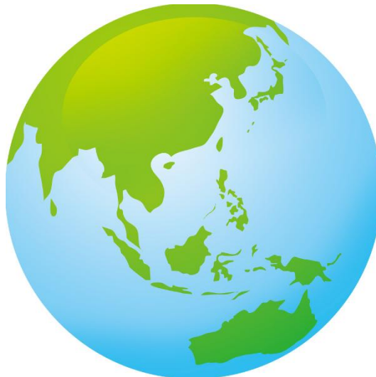
Pacific Center in Hawaii