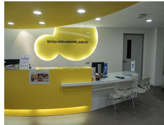
Seoul Office in Korea