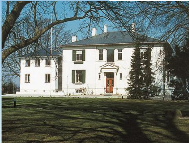
European Center in Denmark